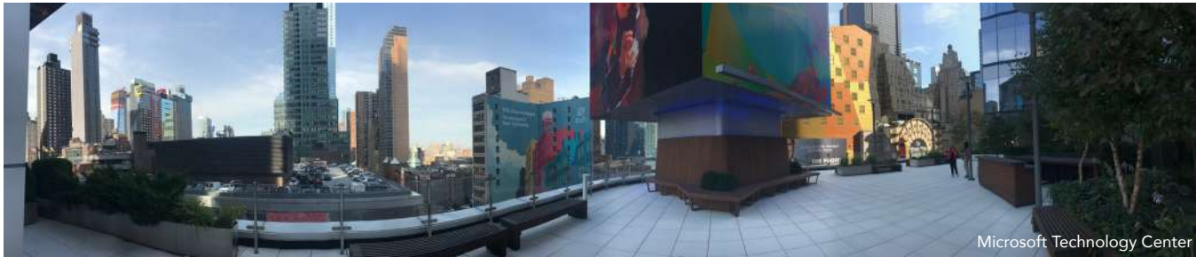
Microsoft Technology Center